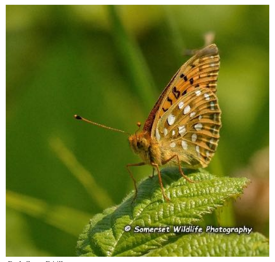
Dark Green Fritillary

Back on home soil, I was back up to Priddy Pools and photographing my next new species: the elusive and extremely rare Black Darter dragonfly. As far as I'm aware this is the only place in Somerset where you can see this stunning dragonfly. A couple of freshly emerged Dark Green Fritillaries added to a lovely day until we skipped over to Blagdon Lake for an hour and I managed another first in the form of a few Ruddy Darter dragonflies. This summer was getting better and better by the hour!