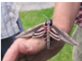
Poplar hawk moth