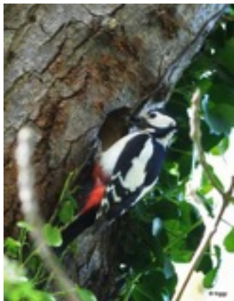
Great spotted woodpecker

November and December 2015 have been generally quiet for birds, partly because of the record warm temperatures; birds don't need to come south when it is so mild.