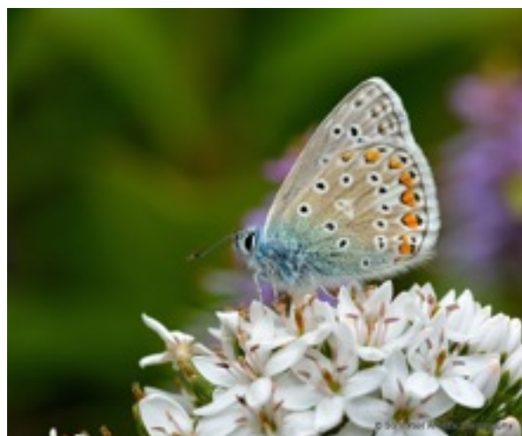
Common Blue Butterfly - Higgy