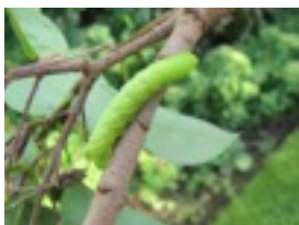
Hawk moth caterpillar

Join our Facebook (closed) group - YACWAG