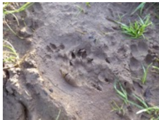
Wonky toe otter footprint