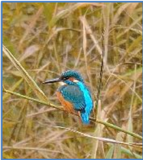
A kingfisher has been seen regularly in Congresbury

In contrast, birds in gardens seem to have, if anything, increased with blue, great and long-tailed tits, goldfinches and perhaps less welcome garden birds such as wood pigeons and jackdaws becoming more numerous. The tit species have benefitted from a dry nesting season followed by a mild winter.