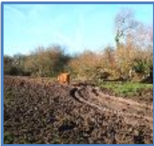
Footmead's access is difficult to negotiate in wet weather

The Society of Friends had purchased Footmead from the Church of England