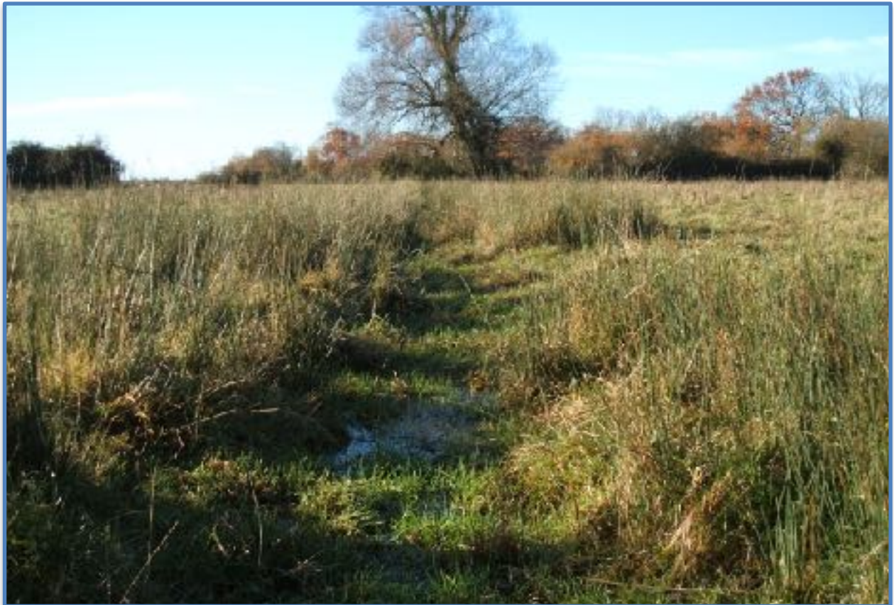
Footmead December 2007, looking west towards Gangwall