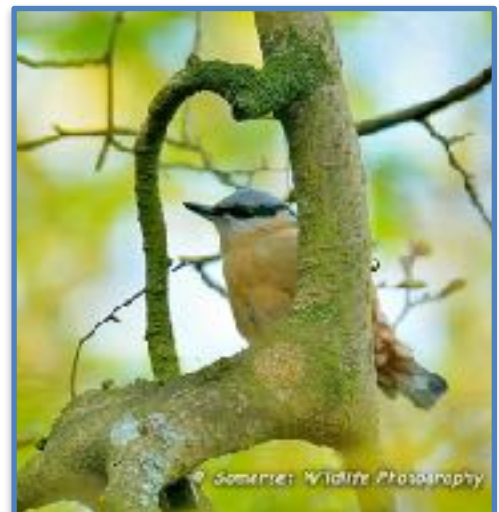
Nuthatches are resident on Cadbury Hill and can be heard calling stridently