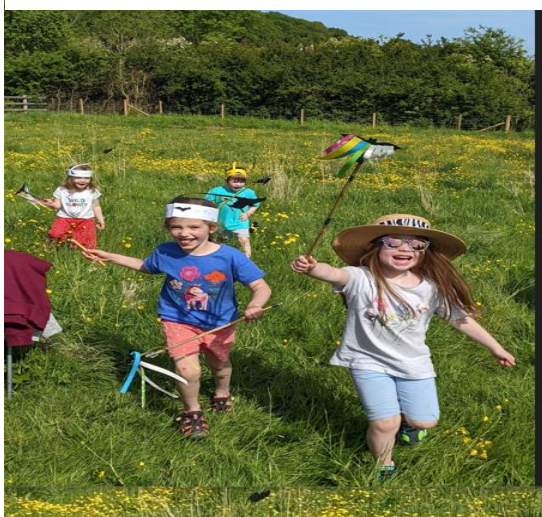
Cobthorn Open Day