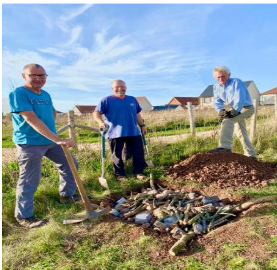
Slow Worm Hibemaculum at Cobthorn