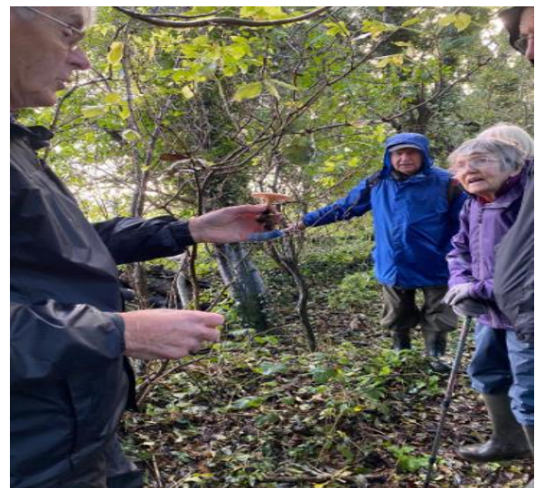
Littlewood Fungus Walk