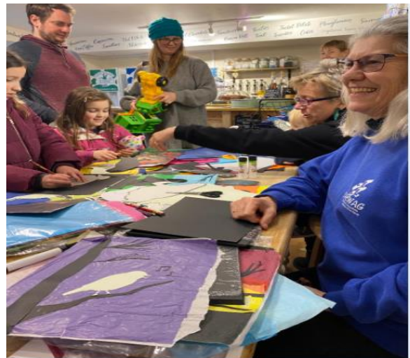
Winter Wonderland Workshop