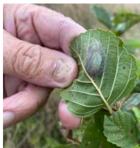
The Miller Photos: Faith Moulin