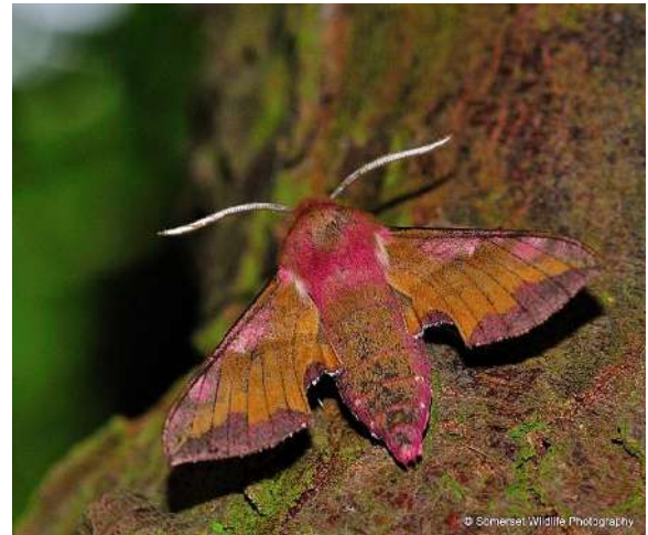
The colourful moth that will emerge next spring.