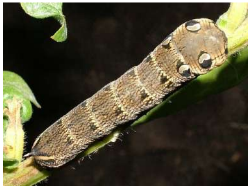
Elephant hawk moth caterpillar. In the wild they feed on willow-herbs and bedstraws but in gardens they are often found on fuchsia.